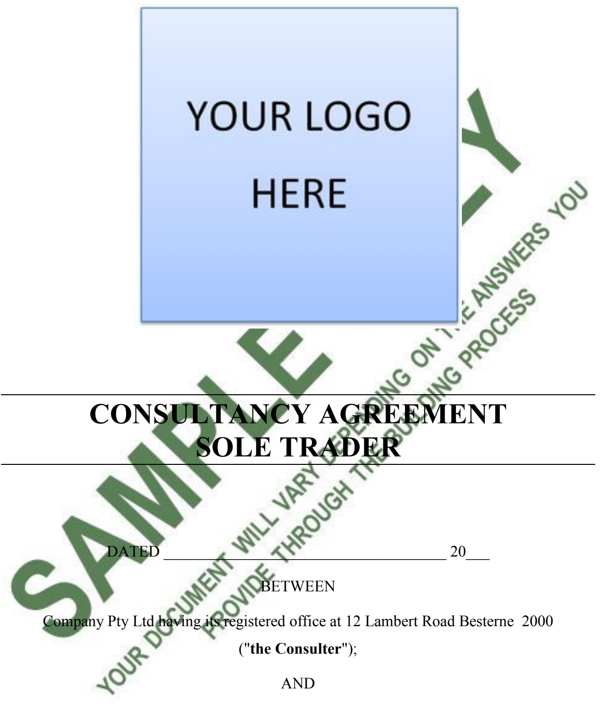
Other Company Pty Ltd having its registered office at 1 Smith Street Pietersberg 7000 (" the Consultant ")